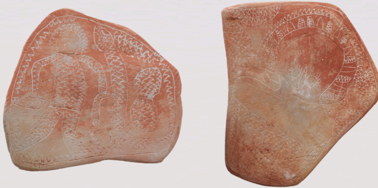
Wandjinas and Creatures, c.1980s

incised slate and natural earth pigments