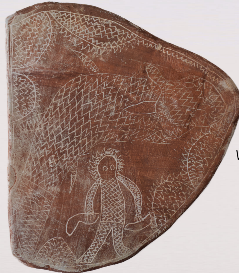
Wandjinas and Creatures, c.1980s

incised slate and natural earth pigments