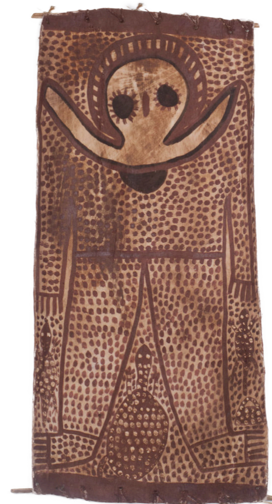
Wandjina Spirit, c.1986

natural earth pigments on eucalyptus bark bears cat.no. AK140 verso in black marker 107 x 47 cm