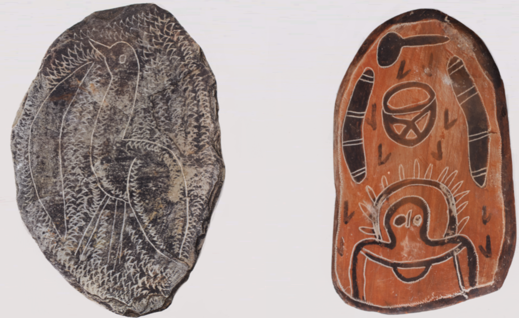
Wandjinas, Tools and Creatures, c.1980s

incised slate and natural earth pigments