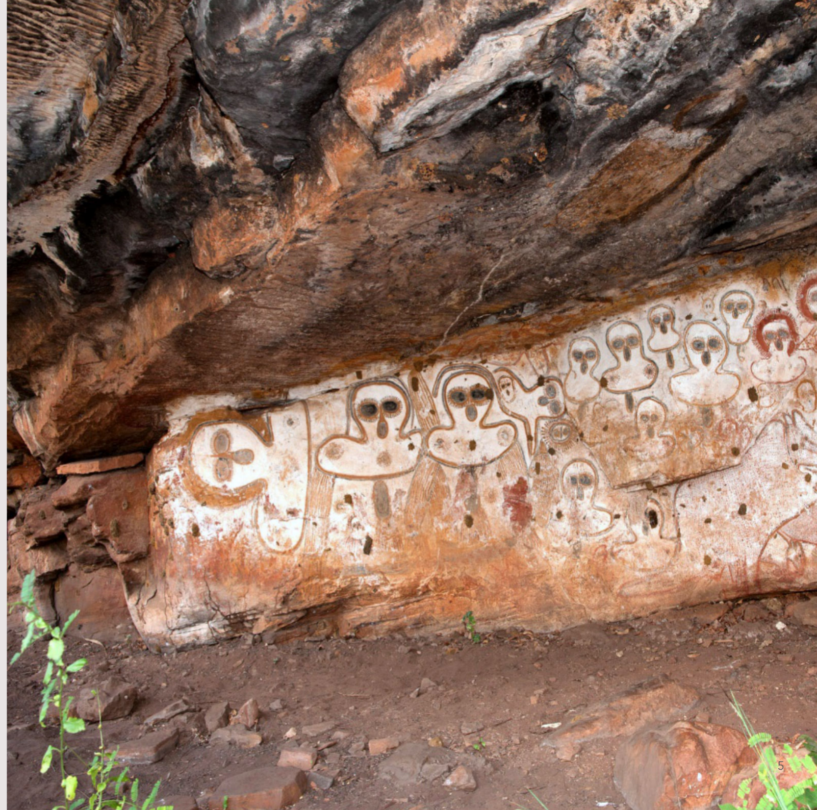
Rock art site near Walcott Inlet, North West Kimberley.