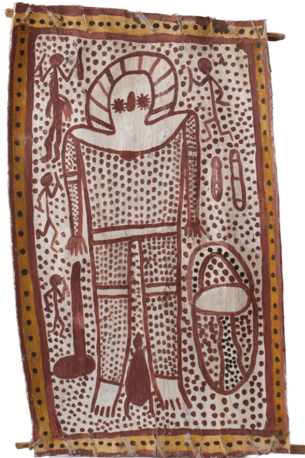
Wandjina Spirit, c.1992

natural earth pigments on eucalyptus bark bears artists name verso in black marker 88 x 49 cm