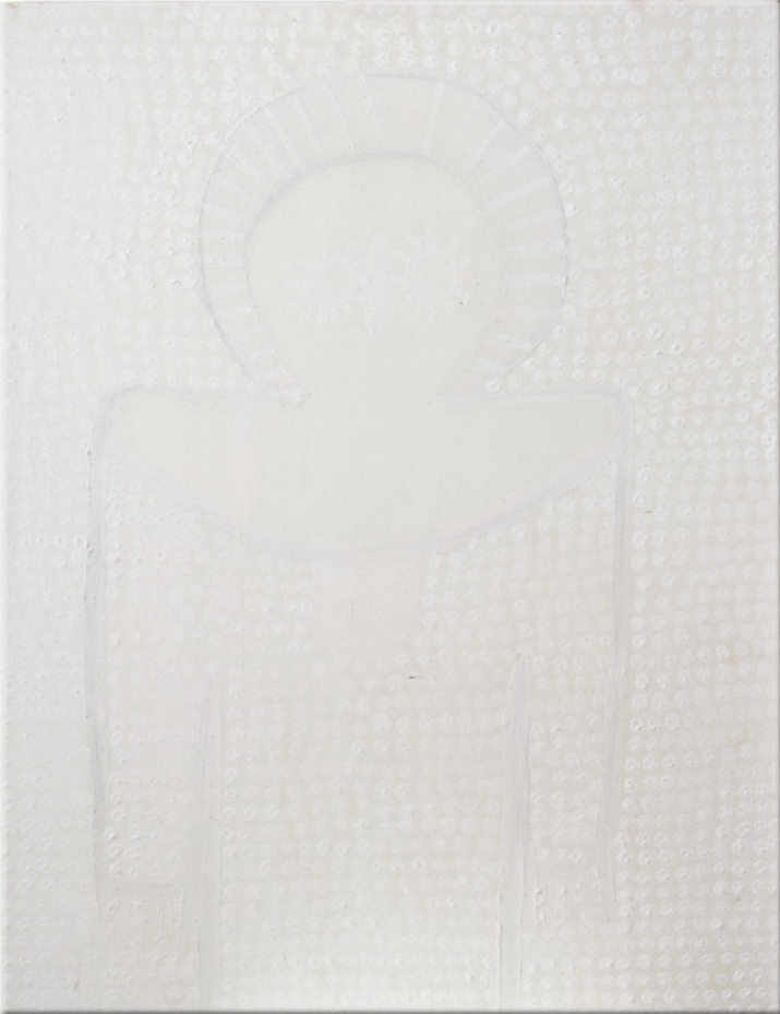
Wandjina Emerging, 2022

natural earth pigments and bush fixatives on canvas bears cat.no.KO2575-22 verso in black marker 80 x 60 cm