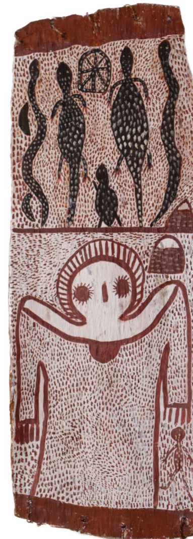
Wandjina Spirit, c.1986

natural earth pigments on eucalyptus bark bears cat.no. AK100 verso in black marker 97 x 35 cm