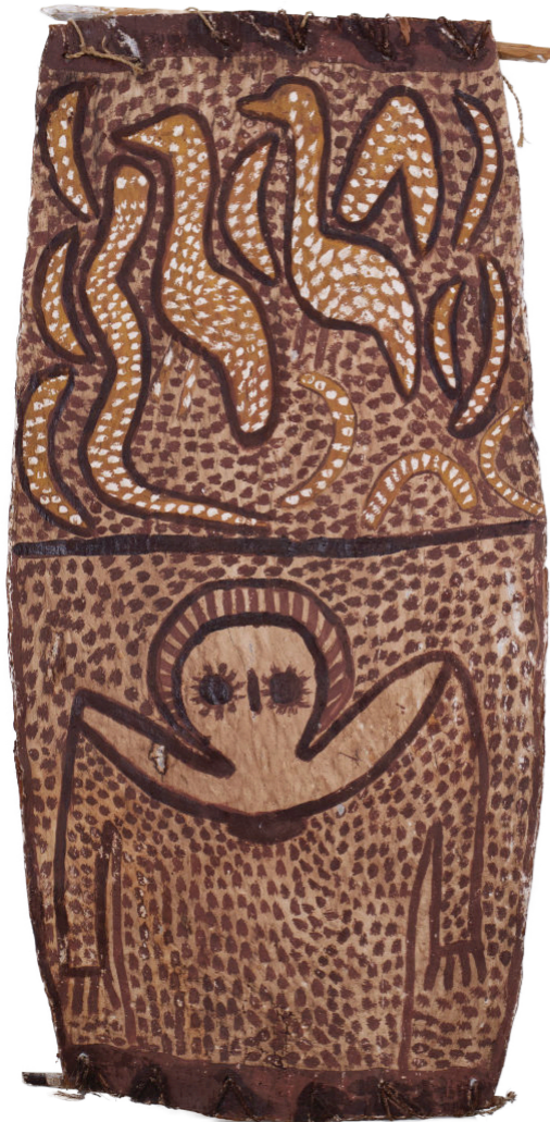
Wandjina Spirit and Animals, c.1986

natural earth pigments on eucalyptus bark bears artist's name verso in black marker 89 x 43 cm