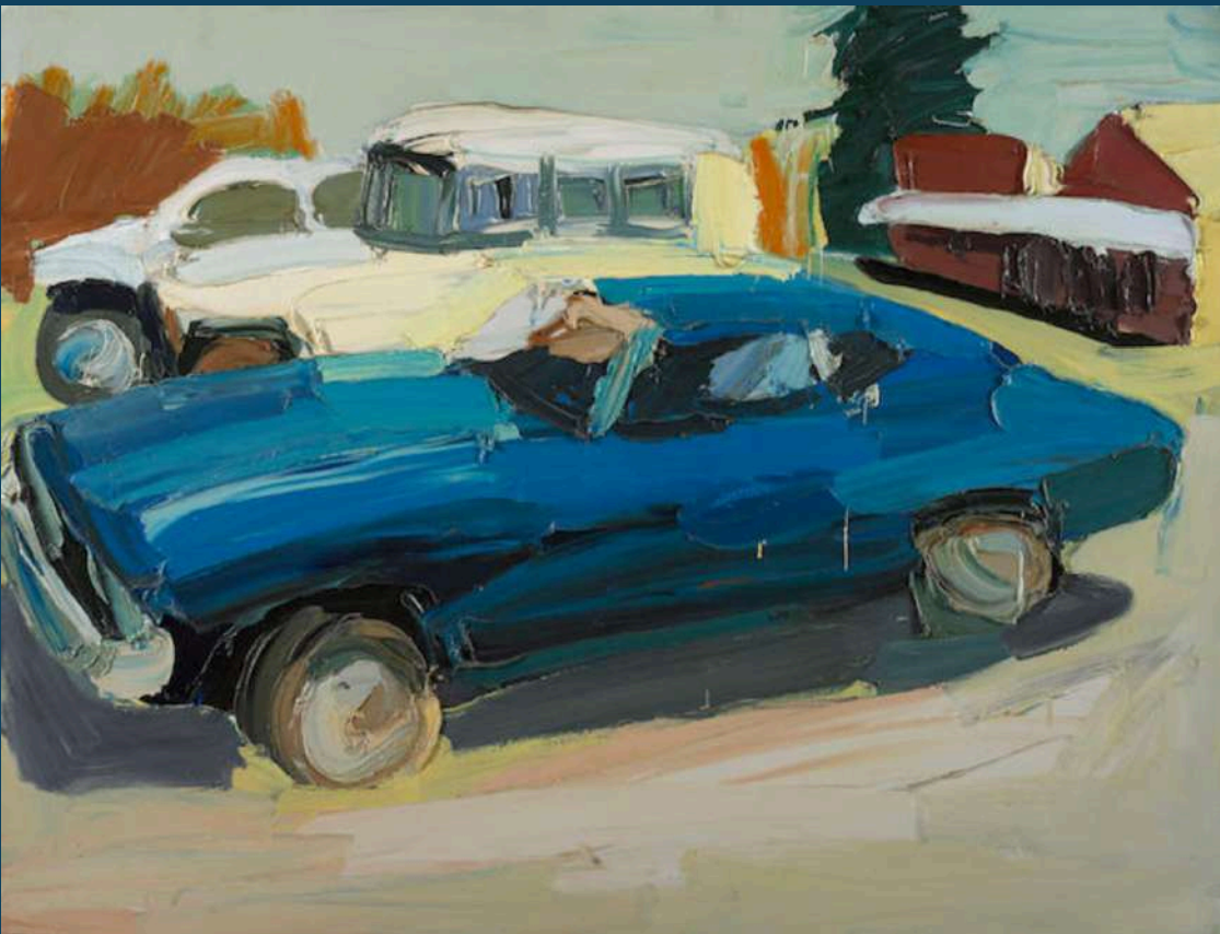
Ben Quilty Hill End Landscape #1 , 2005 oil on canvas 110 by 140 cm.