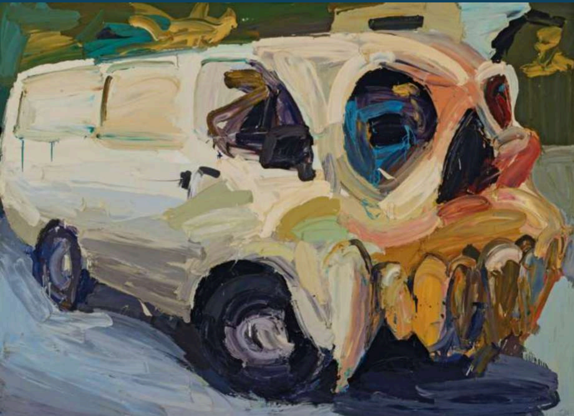
Ben Quilty Skull 3 , 2006 oil on canvas 220 by 300 cm.