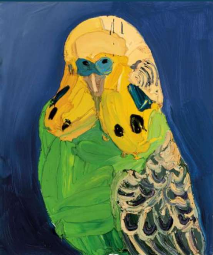
Ben Quilty Beast 2 , 2005 oil on canvas 120 by 100 cm.